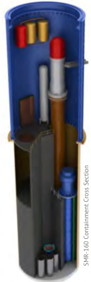
SMR-160 Containment Cross Section