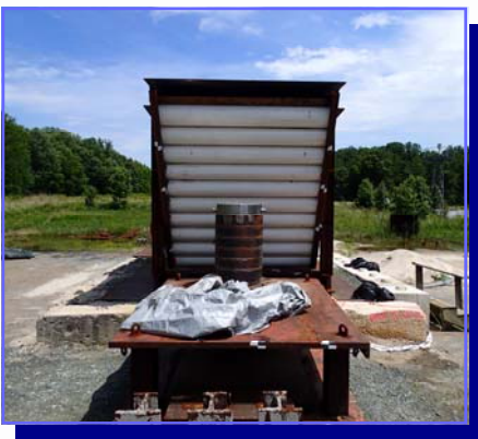
Scaled HI-STAR Test Model In Front of Catch Box Prior To Test

The post-impact inspection of the cask showed that it weathered the impact with large performance margins confirming our dynamicists' predictions; the measured post-impact helium leak rate from the cask's containment boundary, as confirmed by SVTI, was 1000 times smaller than the established acceptance criteria. Additionally, all of the body bolts in the containment boundary of the cask remained elastic and there was no breach of the containment boundary.