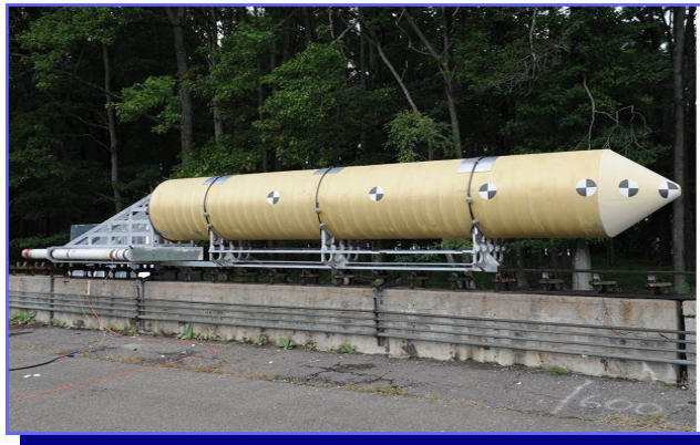
Holtec Engineered Test Missile Designed to Impart the Specified Impact Force vs. Time to the HI-STAR Cask Model